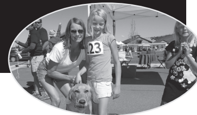
Above is one of our special young participants who raised pledges for GC Pet Pals.